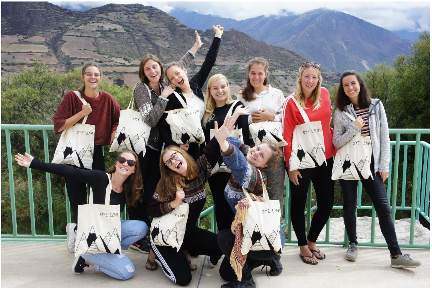
All our volunteers are big fans of their new tote bags!

Are you also interested in a doll or a tote bag? Let us know your preference and we let the mother make your order!